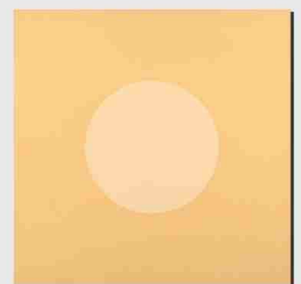
Polished Vitrified Tile