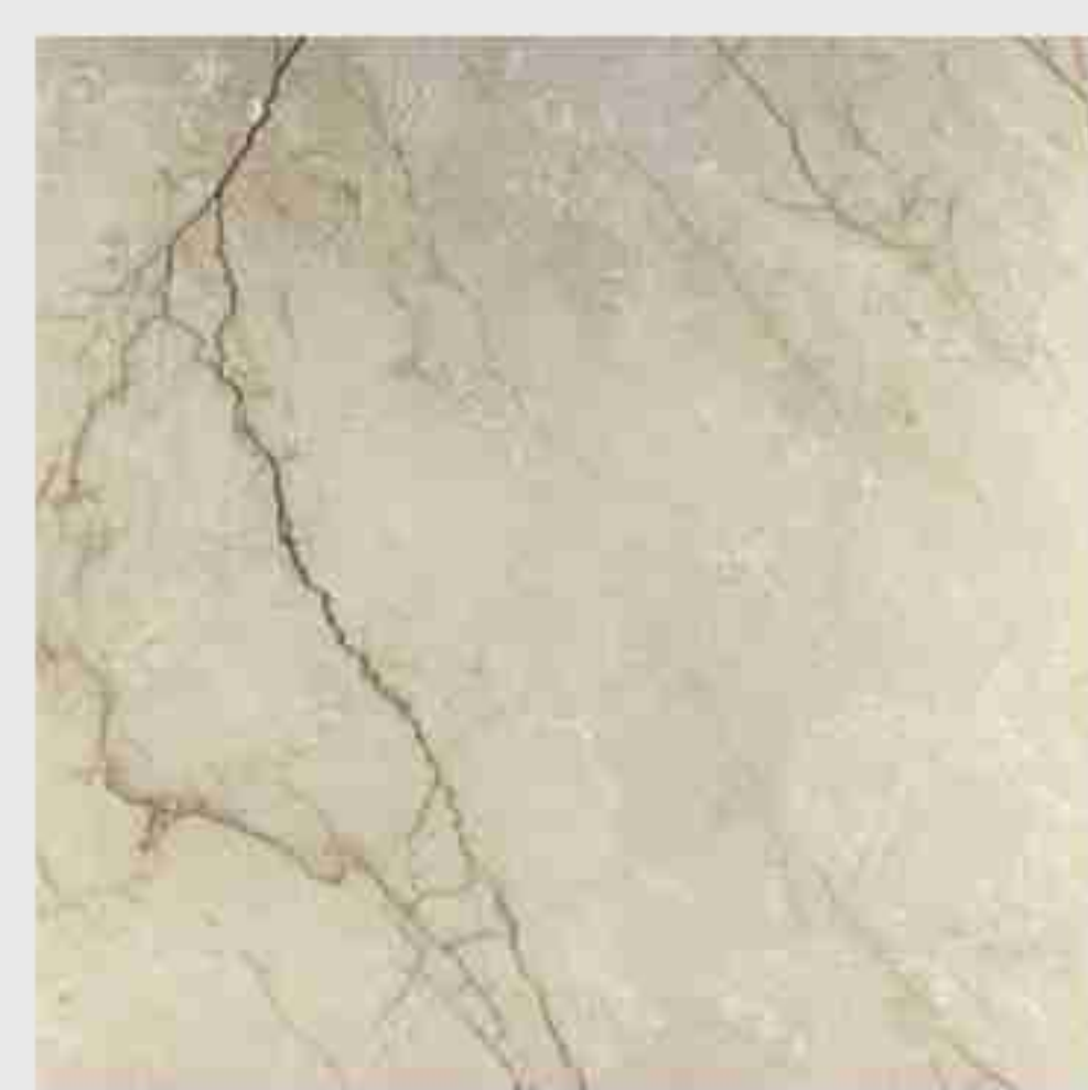
VC Shield Tile